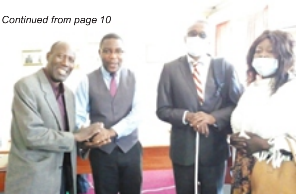
MHUNZA Director and ZAPD Provincial Coordinator Western Province pay a courtesy call on Provincial Administration