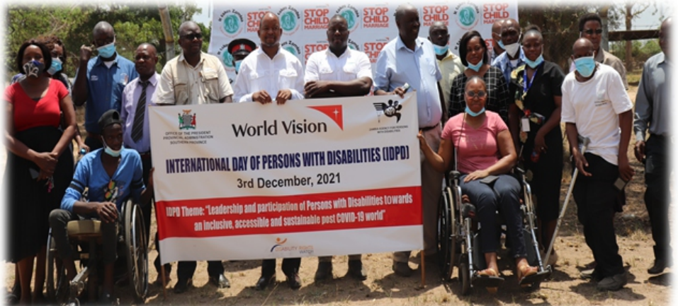
Southern Province Minister Cornelius Mweetwa at IDPD commemorations in Choma

Hon Mweetwa expressed the commitment of the new government to addressing the needs of persons with disabilities and to work progressively to ensure that persons with disabilities assume leadership roles at all levels starting from the communities.