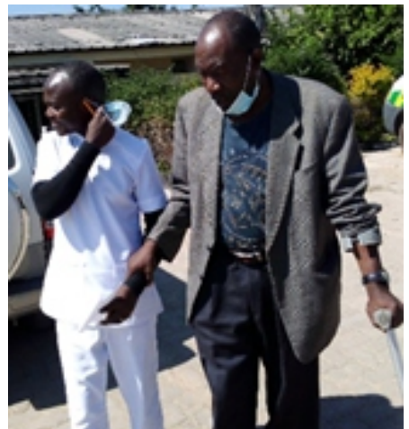
MHUNZA Director with a psychiatry nurse at Lewanika General Hospital