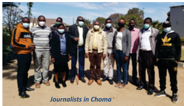
Journalists in Choma

The Mental Health Users Network of Zambia and Disability Rights Watch with support from Validity Foundation and Southern Africa Litigation Centre have an ongoing programme to promote legal reforms on the rights of persons with psycho-social disabilities and enhance public awareness and realization of their rights specifically the right to legal capacity.