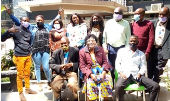
Journalists, persons with psychosocial disabilities and OPD leaders after a media training in Ndola, Copperbelt Zambia

persons with disabilities in line with relevant international treaties (UNCRPD) and determined by the Lusaka High Court.